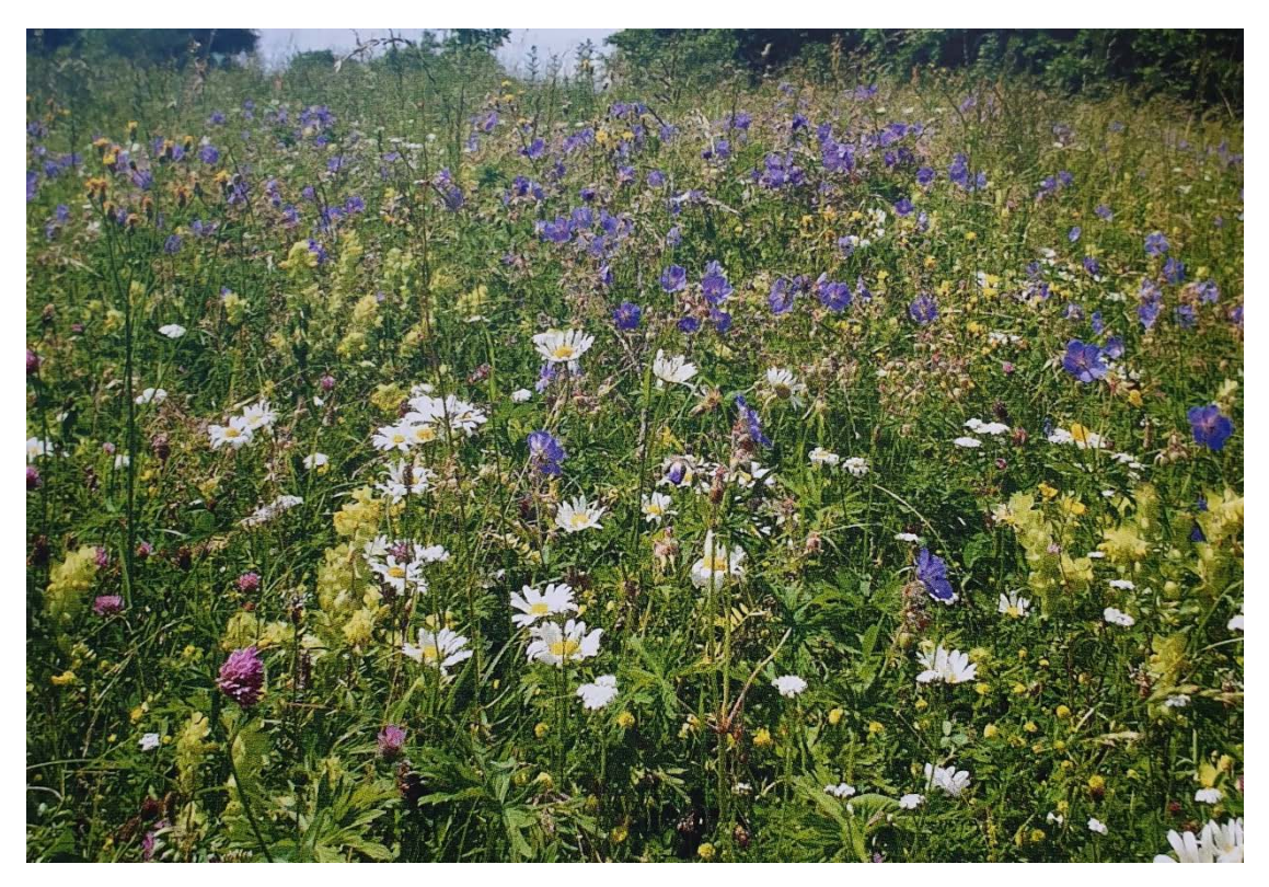
Figure 1: Lean meadow also known as classic flower meadow.

Meadows, pastures, commercial forests and arable land together form our current cultural landscape.